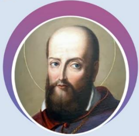
St. Francis De Sales MSFS PATRON